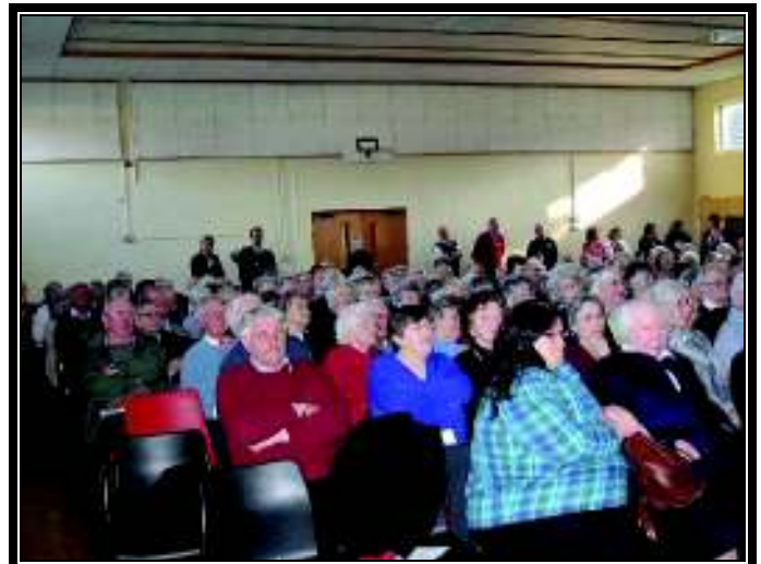
A section of the Seniors audience who enjoyed the concert