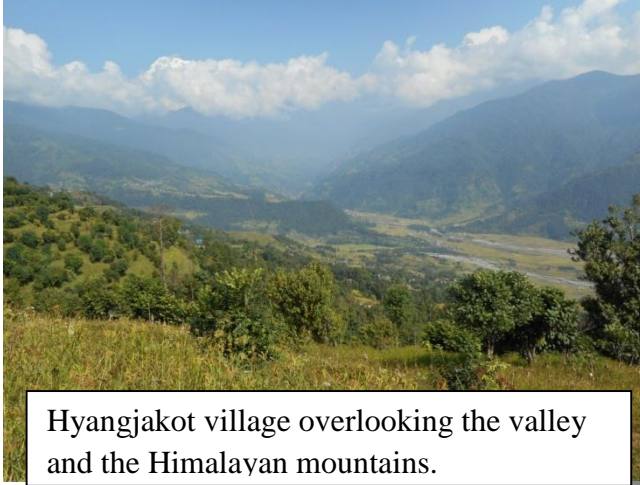
Hyangjakot village overlooking the valley and the Himalayan mountains.