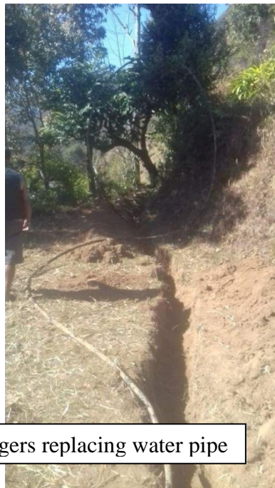
Villagers replacing water pipe