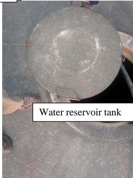
Water reservoir tank