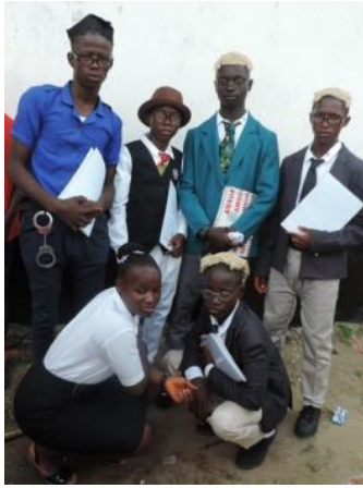
Some of the pupils who took part in the entertainment