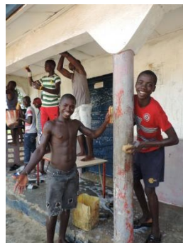
Left: Having fun, painting

More floors have been tiled, the gutters cleaned out, the pump maintained (see picture on left) and lots of painting done.