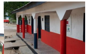
Left & above: the results of the hard work