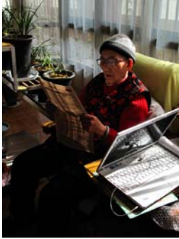
Serena Wang's winning entries - West Berkshire Young Photographer 2014 :