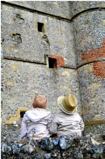
Dagmara Lewandowska : 1 st Prize (Intermediates, 11-14 yrs):