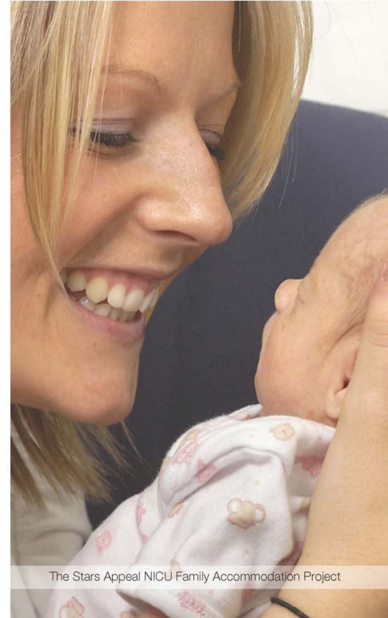
The Stars Appeal NICU Family Accommodation Project

A smile is the best return on our investment