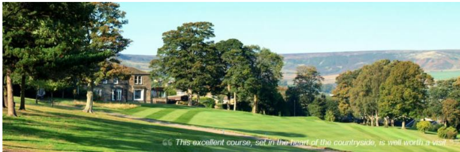
© This excellent course, set in the heart of the countryside, is well worth a visit

Rotary Huddersfield Pennine 1st September Race Night