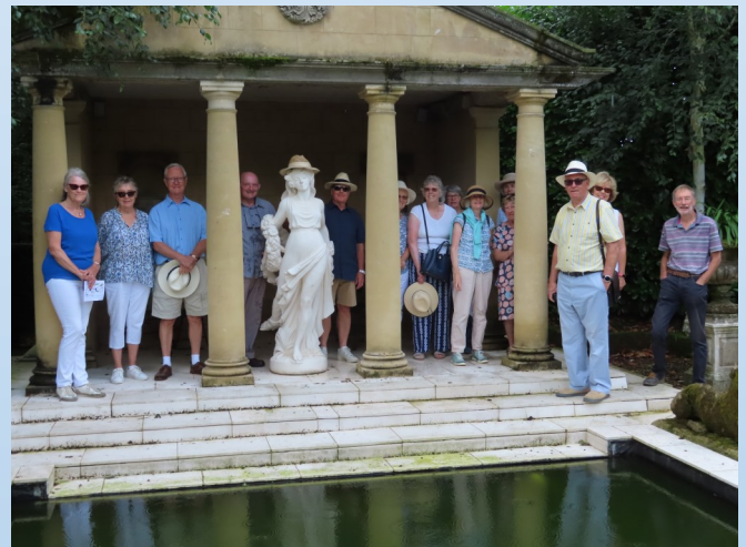
Everyone wants to get in on the act