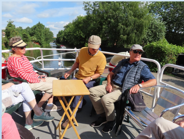
In the afternoon—Wine

tasting a very nice glass of wine and we all agreed it was a really nice day out