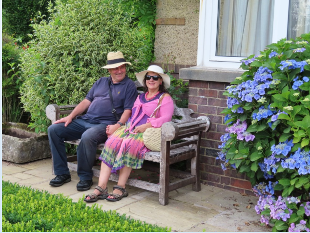
What a lovely pair

The first of our outings was to Burrows Gardens