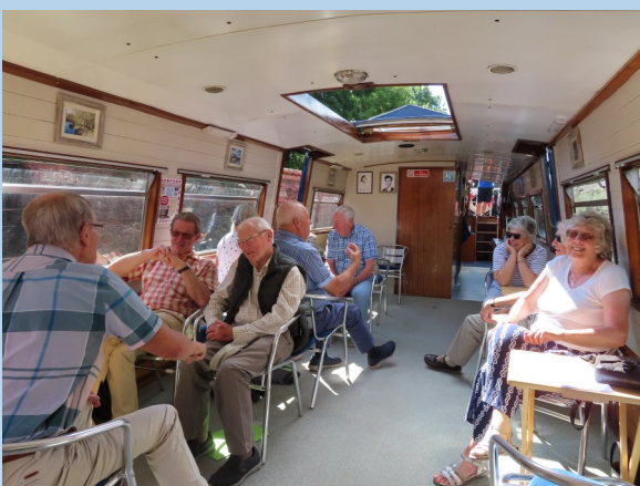
1st Class Accommodation

tasting a very nice glass of wine and we all agreed it was a really nice day out