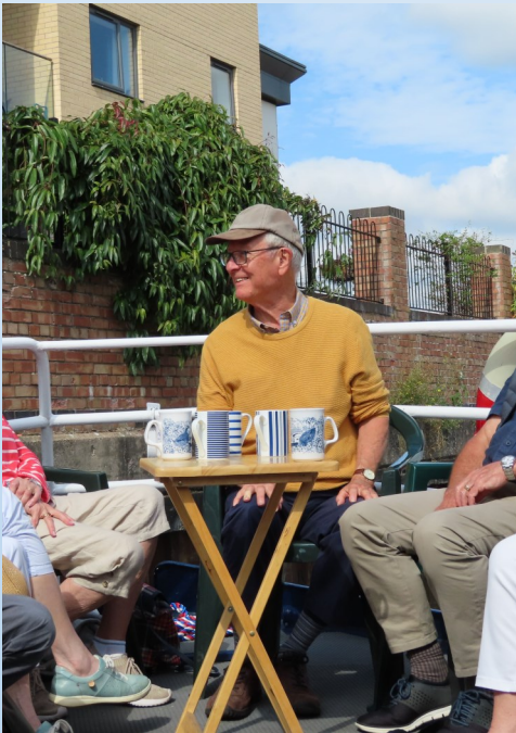
In the morning—Coffee

Loughborough. We sailed along the river Soar to Zouch Lock. On the way we stopped at the Plough Inn in Normanton on Soar for lunch. We returned to Loughborough after