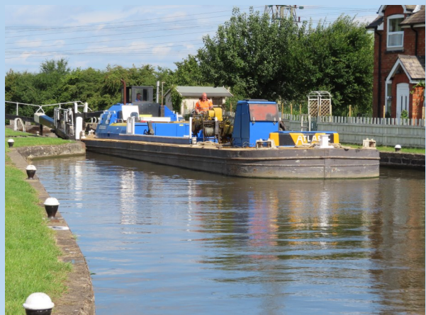
2nd Class Accommodation