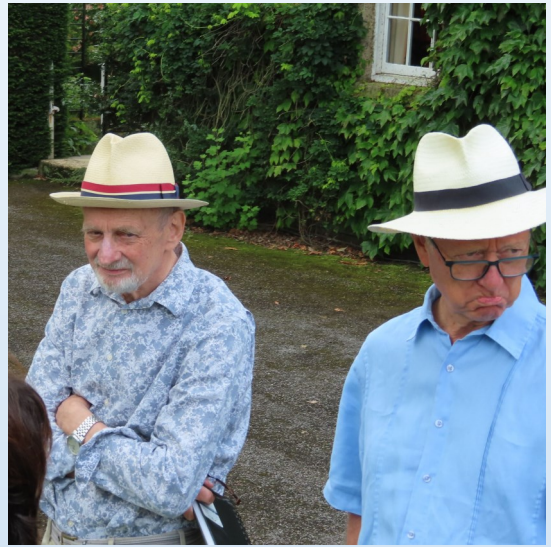
Another lovely pair!