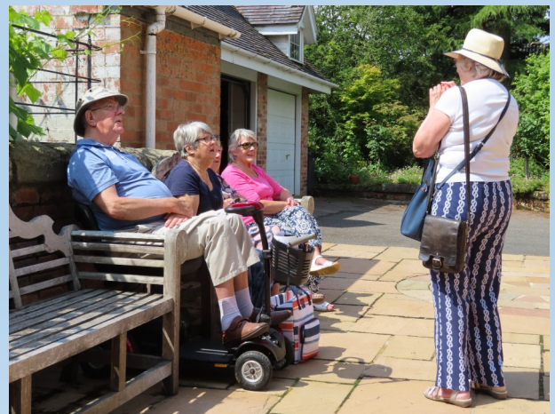
Now I'm going to tell you a story