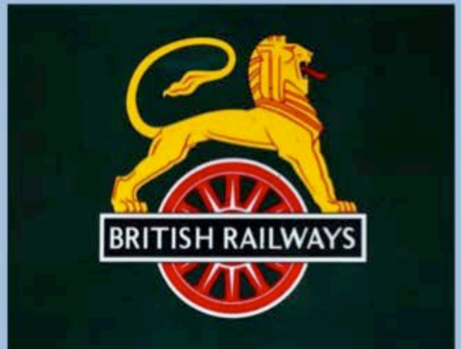
British Railways 1948