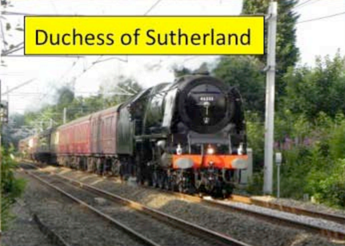
Duchess of Sutherland