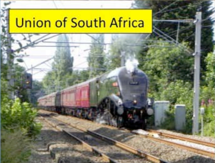
Union of South Africa