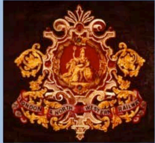
London & North Western Railway 1846